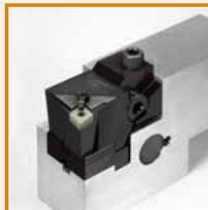
Quick Change Roll Tool