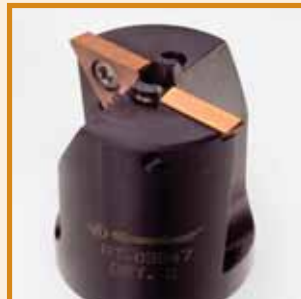
Pod Bore Head