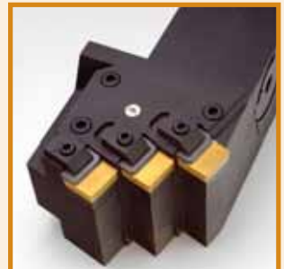
Roll Turning Tool