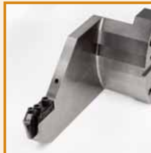
Heavy Metal Head