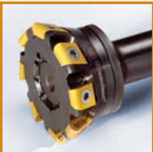
Long Shaft Endmill