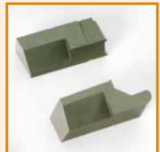
Race Track Groovers