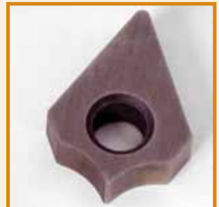
Special Form Insert