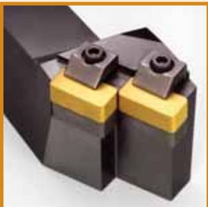
Roll Lathe Tool