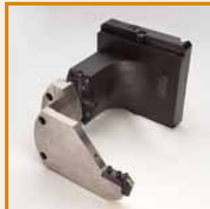
Aero Grooving Tools