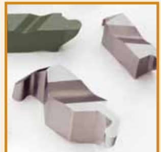
Power Lock™ Groovers