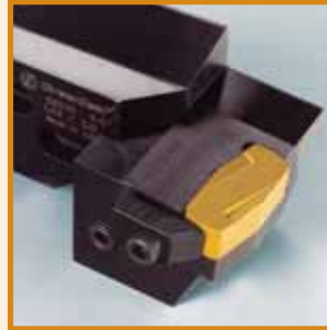
Bar Peeler Cartridge

From its headquarters in Saegertown, Pennsylvania, and a facility in North Carolina, Greenleaf maintains its commitment to pioneering breakthroughs in cutting-tool technology and to delivering Accelerated solutions for customers around the world.