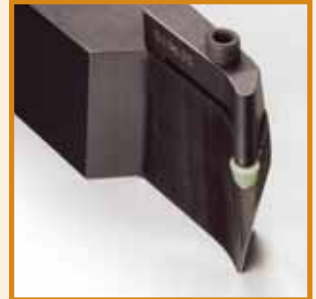
Hook Groove Holder